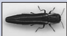
Two Lined Chestnut Borer

Check your trees for signs of tan-colored, tear-drop shaped egg masses on the bark.