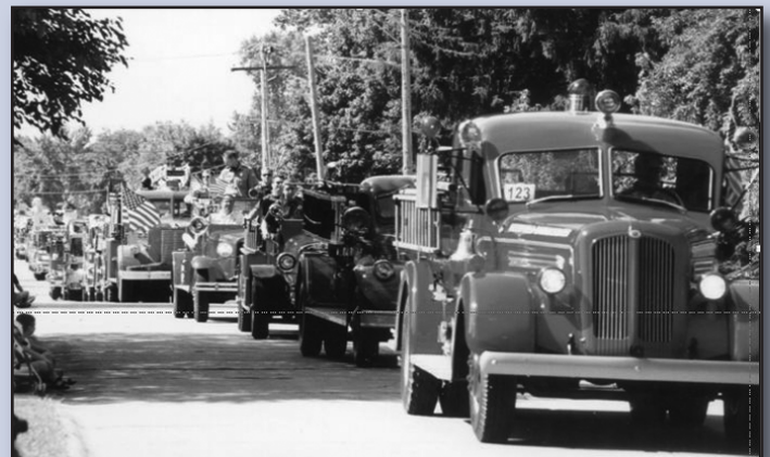
(June, 2001) Northbrook celebrated the 2001 Centennial with a parade of "100 Firetrucks" both old and new. Watch it this month on NCTV – Cable Channel 17– daily at 10am and 6pm. See page 7 for details.

To celebrate the Village's 110th birthday, the Northbrook Historical Society partners with the VFW Post 10236 and American Legion Post 791 to present a Field of Honor. The goal is to have 1,901 full-size American Flags flying in the Village Green from May 26 through May 30. To learn more about how you can participate, see the front cover and the order form on page 3. ❁