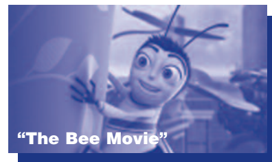
"The Bee Movie"

Start the weekend kick-off with "The Bee Movie." Pack your picnic basket and enjoy dinner on the lawn. The fun begins at dusk behind the Northbrook Library under the Water Tower! This is a Special Fundraiser for the 4th of July festivities. A $20 per family package includes popcorn, drink and candy ticket as well as local coupons and special glow-stick! Sponsored by Mesirow Financial.