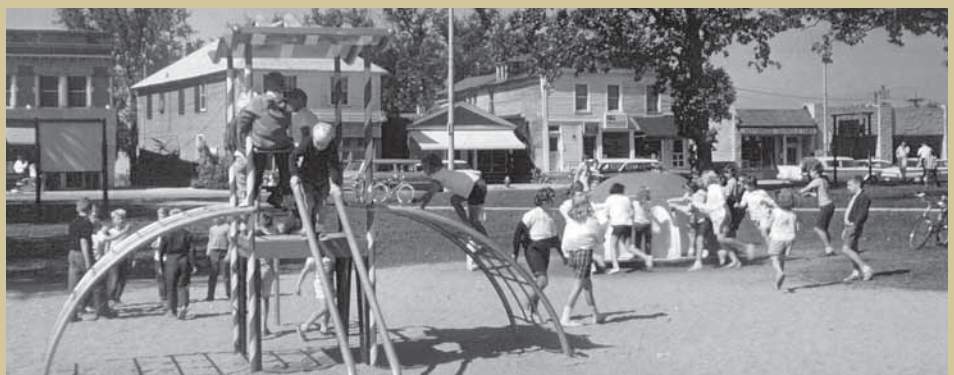
Children enjoying the playground at Village Green Park. Circa 1963.

The frame building that was front and center to the growth of our Village burned just prior to the Northbrook Park District's 1944 acquisition of the grove. The Park District