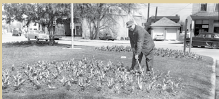
The Triangle at the corner of Shermer and Walters was the Village's first official park.

Each and every day, the Historical Society gives thanks for the Park District's decision to allow the Museum (formerly known as Bartleme's Tavern, originally located at the corner of Waukegan and Shermer Roads) to be moved onto the Village Green. This 42-year-old partnership with the Park District allows us to maintain the Northbrook History Museum and Inn Shop, as well as hold Shermerfest, our annual fundraiser, in the Village Green. It is fitting that the first display in our newly reconfigured Museum is in honor of the 90th birthday of the Northbrook Park and our partnership.