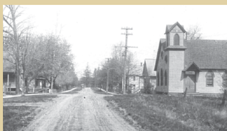
The Hope Union Heritage Center, 1812 Chapel Court.

One hundred and twenty-five years ago, a small frame, non-denominational house of worship was built in a quiet neighborhood backing up to the river that would give its name to our Village years later. The doors to this small house of worship opened to the community for the first time on December 24, 1892. In July of this year, the greatly altered building at 1812 Chapel Court reopened its doors as the Hope Union Heritage Center. Today it is the home of the Historical Society's offices, archives and library.