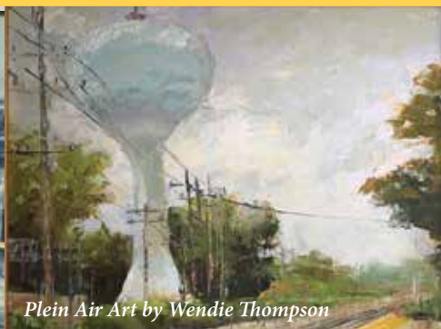
Plein Air Art by Wendie Thompson