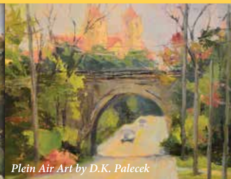
Plein Air Art by D.K. Palecek