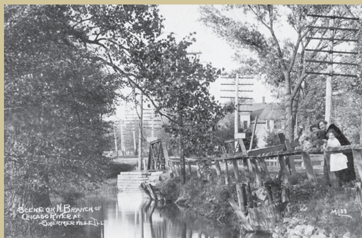
Pictured above is Shermer Road Bridge over the West Fork of the North Branch of the Chicago River, looking east. The lovely Kiest home, at the southeast corner of Shermer Road and Church Street, is seen on the right in this 1912 Shermerville postcard.

The straightening of the river eliminated one bridge and alleviated the frequent flooding of the downtown, as well as Barrenscheen's Grove. Once the straightening was completed, a cement bridge was built over the river on Shermer Road in 1926.