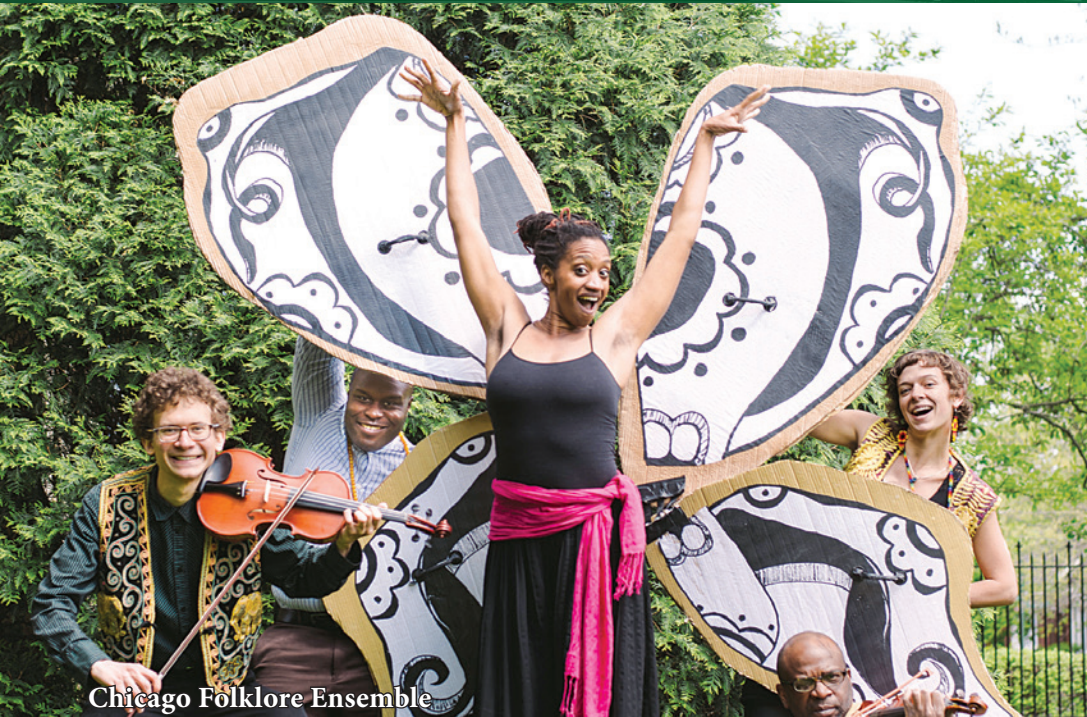
Chicago Folklore Ensemble