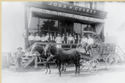
The Landmark Inn circa 1885