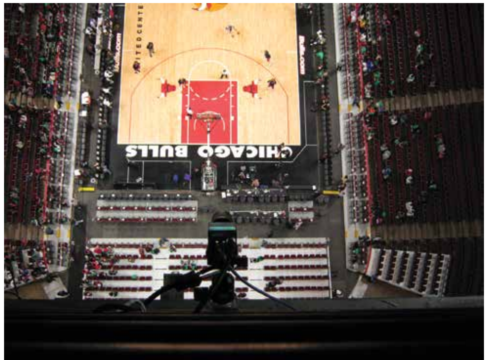
STATS' SportVU player tracking cameras sit high atop the United Center.

Located on 2775 Shermer Road, south of Willow Road, STATS employees 170 at that location and an additional 200 employees throughout the world. For more information regarding the company, visit its website at www.stats.com