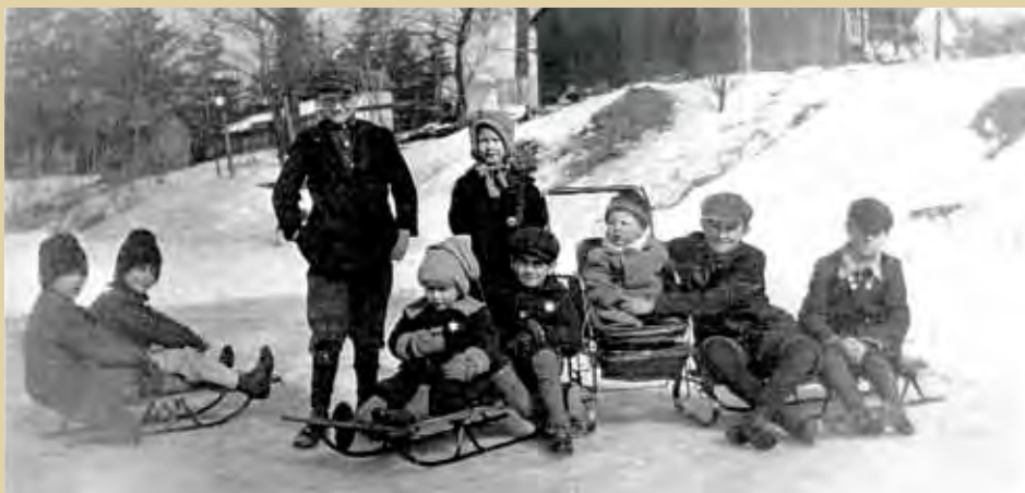
Shermerville children enjoying winter sports on the frozen river behind the Zimmerman house at 1244 Church Street — Circa 1912

The Tower Rink has been in official use since the late 1950s when the Cedar Lane property was purchased for the Village Hall. The rink was considerably larger than