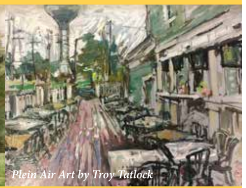
Plein Air Art by Troy Tatlock