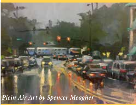
Plein Air Art by Spencer Meagher