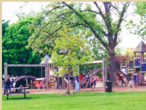
The playground pictured above (circa 1997) was installed in 1991 and dismantled and sent to Armenia in 2003.

On Nov. 25, 1944, the residents of Northbrook went to the polls during a special election. They voted to approve a bond issue for the Northbrook