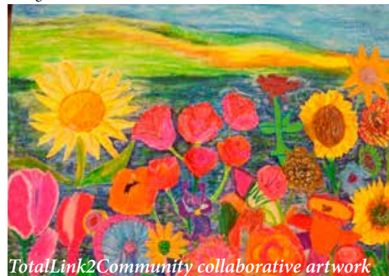
TotalLink2Community collaborative artwork

Northbrook Artists Studio Tour on Sat., Nov. 9, from noon to 4pm. Meet local artists while viewing their work. Visit www.northbrookarts.org for more information and tour map or start the tour at Village Green Center