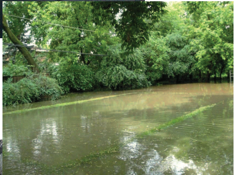
Backyard Flooding at 1340 First Street looking Southwest