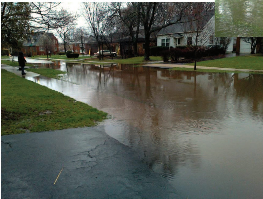
2018 Center Avenue looking Southeast