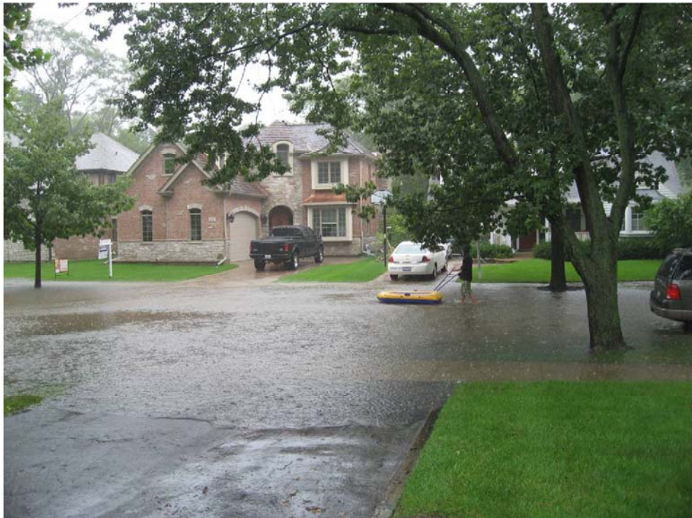
2400 Block of Oak Avenue