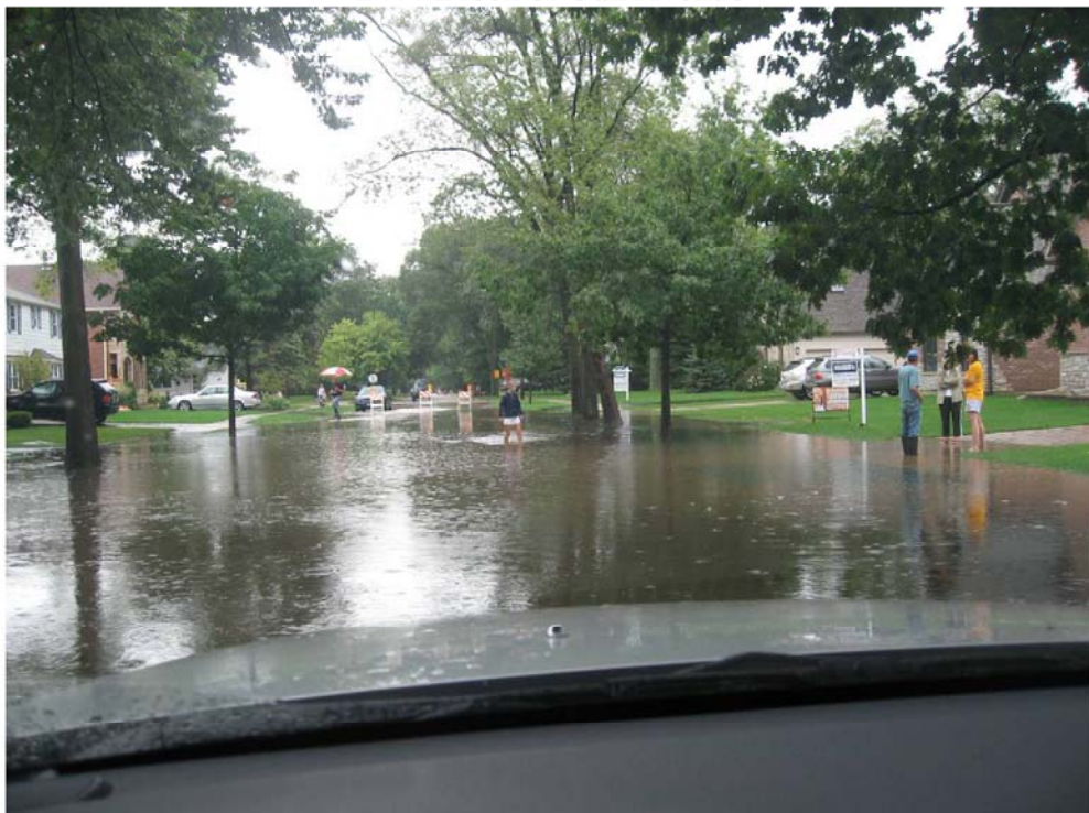
2400 Block of Oak Avenue