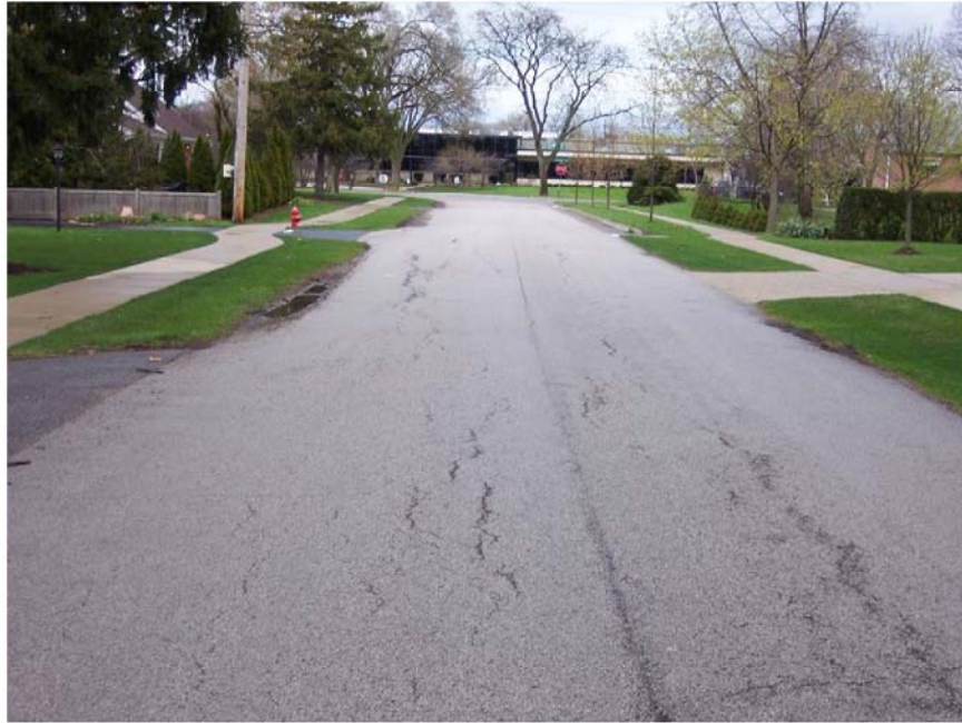
2000 Block of Woodlawn Road