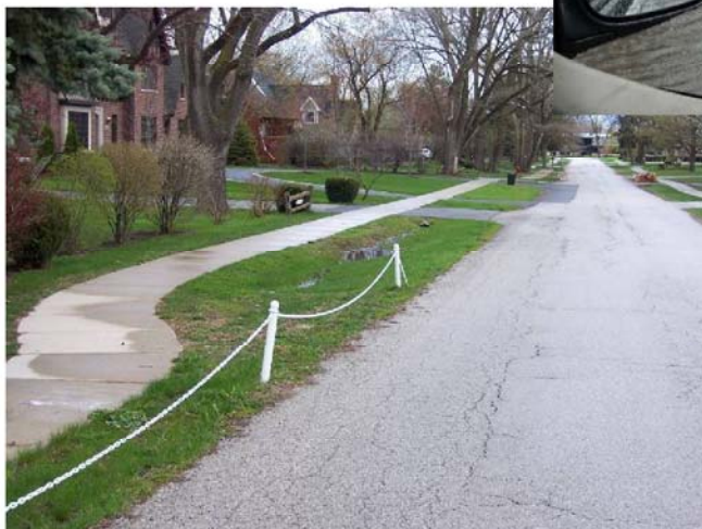
2100 Block of Woodlawn Road