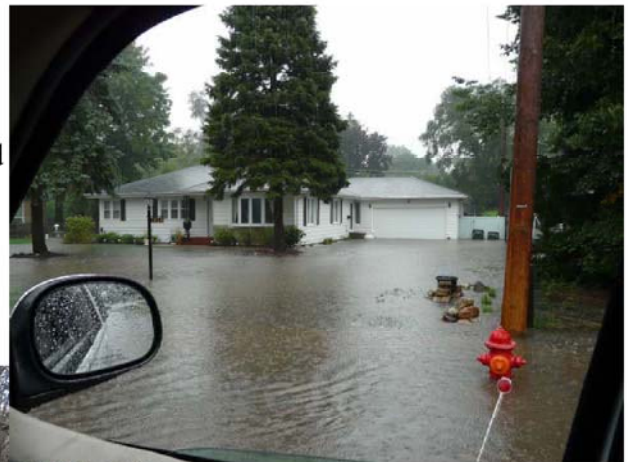
2000 Block of Woodlawn Road